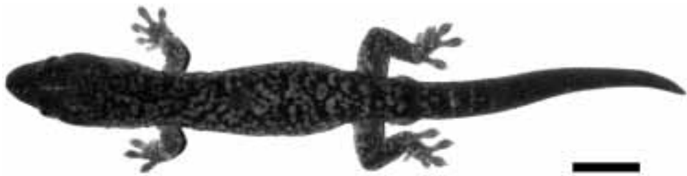
FIGURE 1. Holotype of Oedodera marmorata (MNHN 2004.0015). Note large head, wide neck, relatively slender tail, and marbled dorsal pattern. Scale bar = 10 mm.