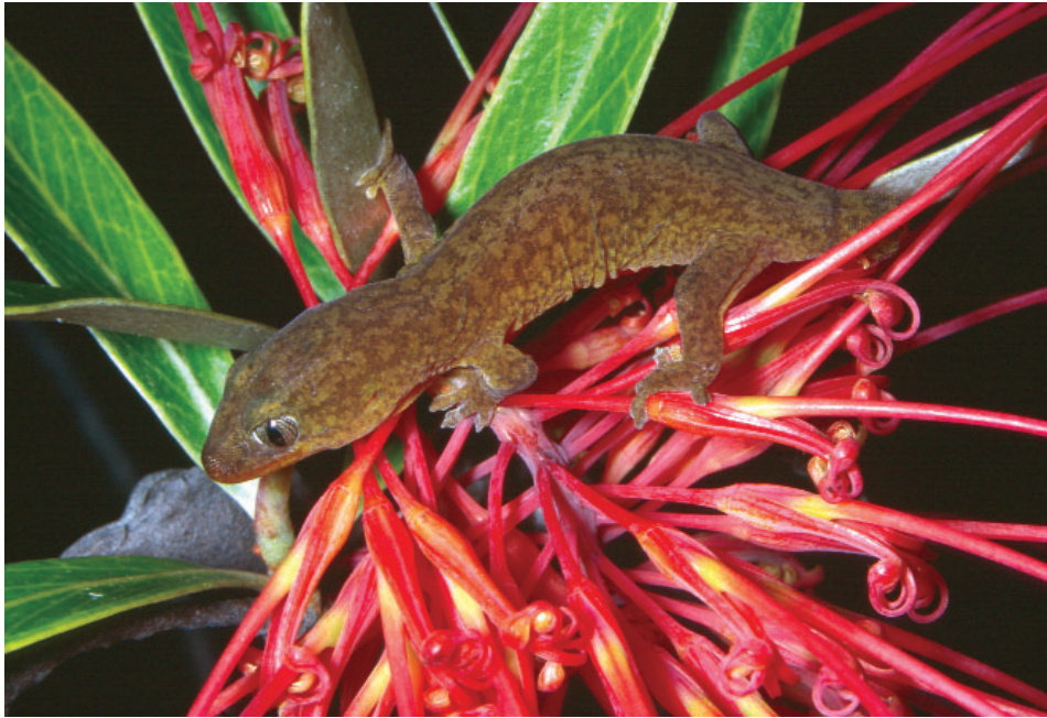
PLATE I. Juvenile Oedodera marmorata (AMS R 161254) in life, illustrating marbled dorsum and yellowish undertones, especially on lower margins of the body. Specimen is shown on a flower of Grevillea meisneri Montrouzier (Proteaceae), an endemic lowland maquis plant that occurs at the localities where O. marmorata has been collected.