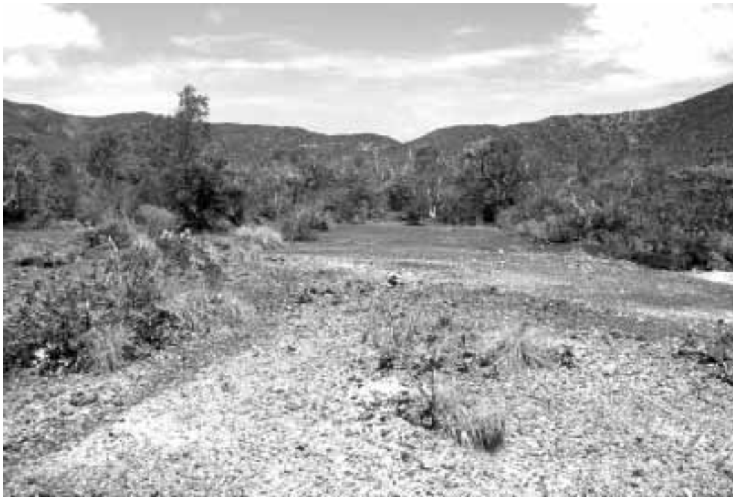
FIGURE 4. Habitat typical of localities at which Oedodera marmorata has been found near Paagoumène, Province Nord, New Caledonia.

this monotypic genus that would maintain monophyly is the inclusion of all New Caledonian taxa in a single genus. We deem this option inappropriate because it would lump highly divergent lineages together and disrupt accepted usage for all of the named genera in New Caledonia.