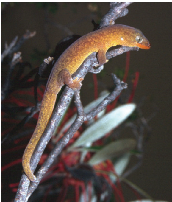
PLATE II. Juvenile Oedodera marmorata (AMS R 161256) in life. Note yellowish markings on flanks and tail and orange labial scales. Twig on which specimen is climbing is typical of narrow perches on which most specimens were found.